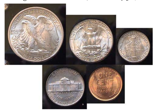
The reverses of a BU 1940-P Year Set [Use a 3X glass or magnify up to 200% to see details.]

During the 1930's and 1940's the Philadelphia Mint produced the most coins and the best strikes of the three Mints. The 1940-P half dollar shown was presumably under graded as a MS-63 by the dealer as it only cost only $20.00 back in 1977. It was certified MS-65 by PCGS in 2012. The Quarter has the obverse of a 63, a reverse of a 64 and would probably grade MS-63. The dime is a MS-64 but the reverse does not exhibit fully split bands which lowers its value somewhat. With over 176 million struck, the 1940-P Jefferson nickel is extremely common date and despite the lovely gun metal toning, MS-65's still cost only $4.00 today. The 1940-P cent probably grades MS-64 Red. All 1940-P mintages are plentiful and none of the coins are expensive.