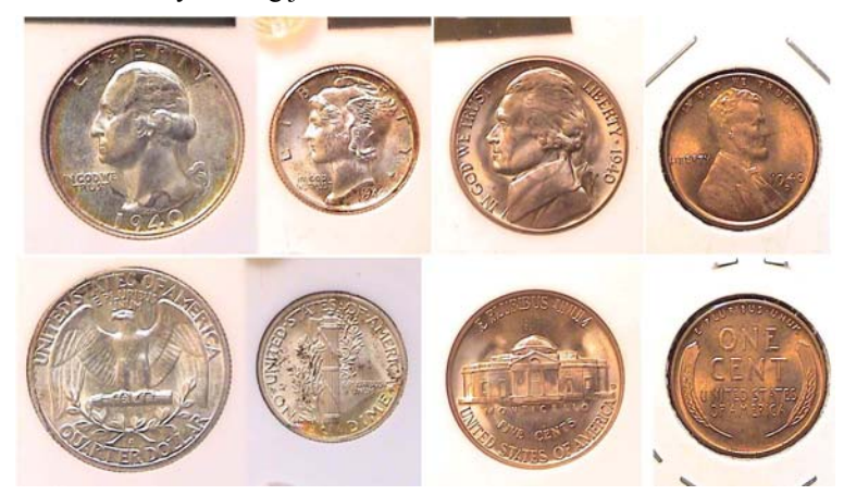
An uncirculated 1940-D Year set shown actual size

denominations; the cent, nickel, dime, quarter and half dollar. These were struck at the Philadelphia, Denver and San Francisco Mints but in 1940, no half dollars were coined at the Denver facility leaving just the four coins shown below.