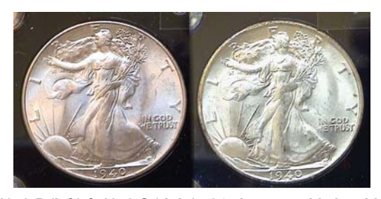
1940-P (left) & 1940-S (right) 50¢ obverses side by side Compare the strikes of Miss Liberty's left hand

The San Francisco Mint produced all five denominations in 1940 but in lower numbers than at Philadelphia Mint. While none are considered scarce, 1940-S pieces grading MS-64 or better are priced slightly higher than the 1940-P's in the same grades. The San Francisco Mint strikes tend to be much softer than both the Philadelphia or Denver issues and this is all the more clear when you compare the two half dollar obverses.