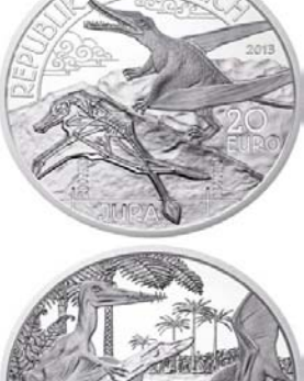
plus 20 Austrian Euro coin (above)