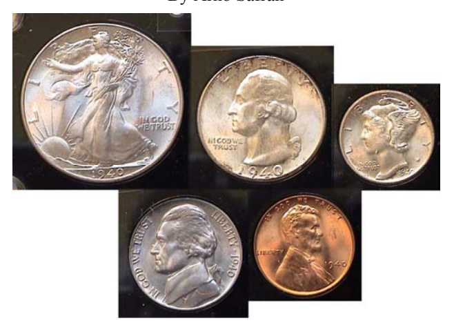
The obverses of a BU 1940-P Year Set [Use a 3X glass or magnify up to 200% to see details.]

Seventy-five years ago America was emerging from the Great Depression. Despite the improvement in economic conditions there was uneasiness among the people. War had erupted throughout Europe with Hitler's armies moving through France, Belgium and Holland to the north while ravaging Czechoslovakia, Austria and Poland to the east. The German-Soviet Non-Aggression Pact signed in 1939 was only a delay to the invasion of Russia in 1941. Meanwhile the Luftwaffe's Blitzkrieg over England was exacting a crucial toll on the British who were expecting a German invasion at any moment. During 1940, Americans began to again enjoy some of the leisure pleasures of life. Folks listened to the radio, went to the movies, took short vacations wondering if they would be drawn into the raging war across the Atlantic some 3,000 miles away.