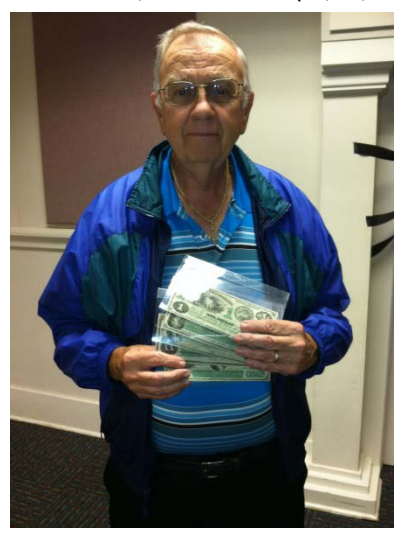
shown by JJ. Engel