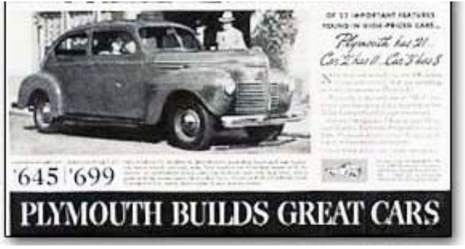
Ad for a 1940 Plymouth 2 door Sedan

Nationwide, the mean price of a new home was $3,900; more in the larger cities and suburbs; between $5,500 and $9,000. In 1940, rent averaged $30.00 a month and a new car cost around $700. Gas to fill it cost 11¢ a gallon.