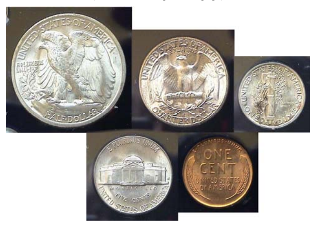
The reverses of a 1940-S BU Year Set [Magnify up to 500% to see S mintmark and full bands on Mercury dime.]

The San Francisco Mint produced all five denominations in 1940 but in lower numbers than at Philadelphia Mint. While none are considered scarce, 1940-S pieces grading MS-64 or better are priced slightly higher than the 1940-P's in the same grades. The San Francisco Mint strikes tend to be much softer than both the Philadelphia or Denver issues and this is all the more clear when you compare the two half dollar obverses.