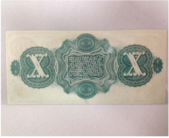
Front & Back of $10 South Carolina Revenue Bond Script from 1872 in Uncirculated condition, one of the set ($1, $5, $10, $20, $50