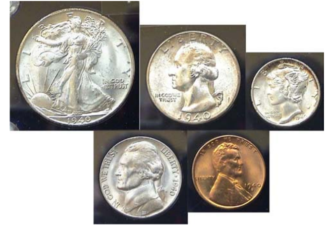
A BU 1940-S Year set. [Use 3X glass or magnify to 200%]

Of the four denominations produced at the Denver Mint in 1940, only the 1940-D quarter with a mintage of 2,797,600 is considered a better date. According to the 2016 Red Book a 1940-D 25¢ grading MS-63 is listed at $165 and in MS-65 at $300. Starting with the 1932-D and S issues the 1940-D is the last of the scarcer Washington quarter normal date issues and may even be a "sleeper".