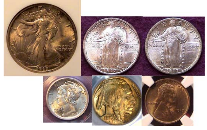
The obverses of a certified BU 1917 year set

Among the early dates, the 1916-P & D along with the 1917-P, 1918-S and 1920-P are fairly common and inexpensive, the 1917, especially so with a mintage of 12,292,000. The 1917 also comes with a sharper strike than the 1916 and is moderately priced thru MS-64. In 1916 and the first part of 1917, the D & S Mintmarks were placed on the obverse under the date. In the latter part of 1917, the mint mark was moved to the reverse near the rim on the lower left side of the eagle. All 1917 branch mint issues are scarce and expensive however.