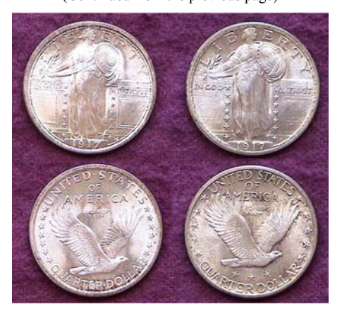
The 1917 Type 1 (left & Type 2 right) SL Quarters side by side Seen together, one can easily observe the changes [Use 3x magnifying glass or enlarge page to 200%]

In addition to the foregoing changes noted on the previous page, Miss Liberty's Shield was subtly altered in the Type II version with fewer, if larger stars placed around the circumference and replaced by a neater, more circular shroud at the bottom.