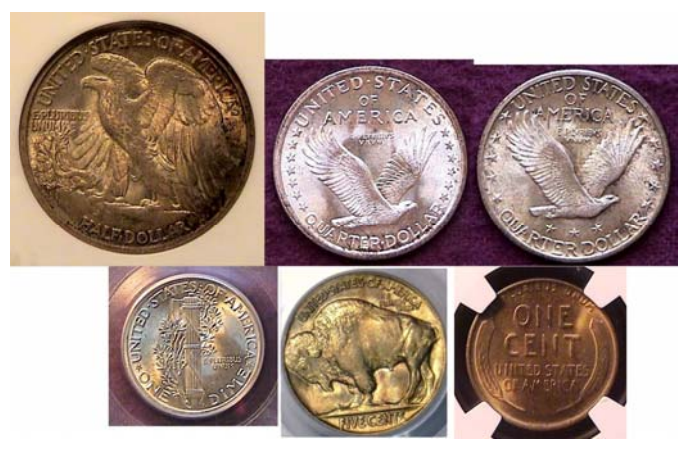
The reverses of a certified BU 1917 Year Set

With a certain amount of study, observation and focus, one can assemble a 1917 year set grading BU at a moderate price. While not "rare", the satisfaction for the collector comes from 1) the attractiveness of all of the coin designs, 2) the balanced appearance of the set and 3) completeness.