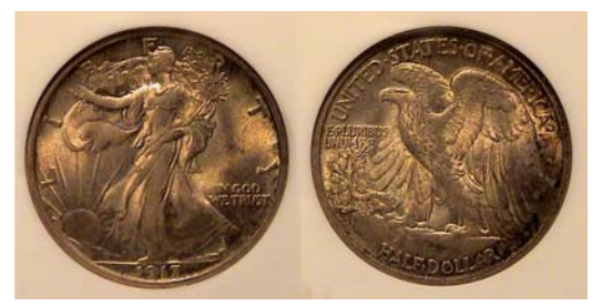
A richly toned 1917 Walking Liberty Half dollar Graded MS-63 by NGC [Use 3x magnifying glass or enlarge page to 150%]

The mintage for the 1917-P Type II Standing Liberty quarter was 13,880,000, around five million more than the Type I and is priced slightly lower than the Type I in the same grades.