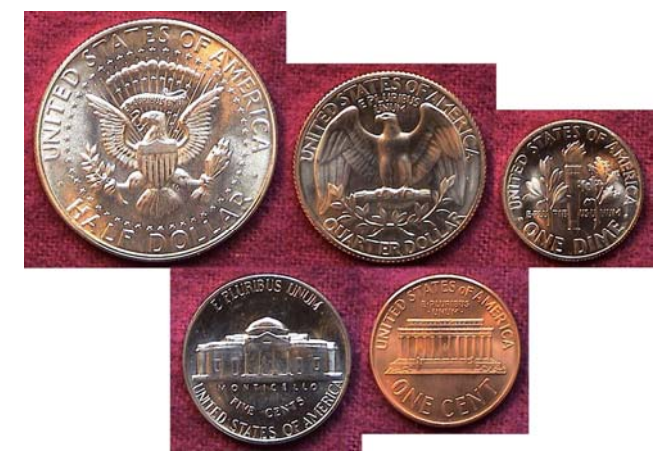
The reverses of the coins of 1965 our (first clad coinage)

Most other nations had switched to either billon, (coinage with less than 50%% silver) , or base metals such as cupro-nickel or brass.