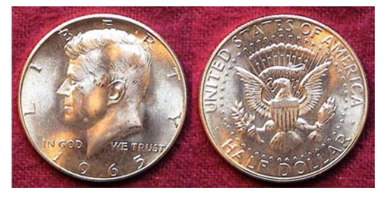
A 1965 Kennedy half dollar from the Special Mint Set Unlike the dime and quarter the coin was struck in 40% silver

The Kennedy half-dollar obverse was designed by Chief Engraver Gilroy Roberts in 1964 with the reverse being created by the man who succeeded him, Frank Gasparro. In 1965, the Philadelphia and Denver Mints combined to strike 65,879,366 Kennedy half dollars. The coin was struck in 40% silver which makes it a billon coin. While the mintage pales compared to the combined 429,509,450 coined in .900 fine silver the preceding year, half dollar collectors were given a teaser since the coin could have had no silver in it at all. The use of 40% silver alloy in the half continued thru 1970. In 1971, it would join the quarter and dime as clad cupro-nickel coins.