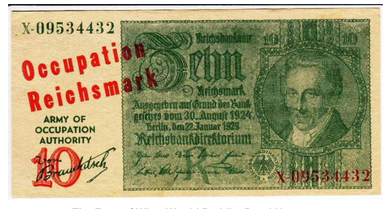
The Face of What Would Be Like Bond Note

This is an interesting story but what does it have to do with numismatics? The German money issued was actually a copy of the face of a German 1929 10 reichsmark note and was labeled as an "Occupation Reichsmark" and was signed by (Walther) von Brauchitsch, who was Commander of the German Army during the early part of World War II. The back has text that promotes buying bonds. I was in Canada in July 2015 and came across this note in a coin shop and had to have it.