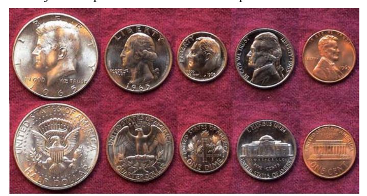
The complete five-piece 1965 clad Special mint Set