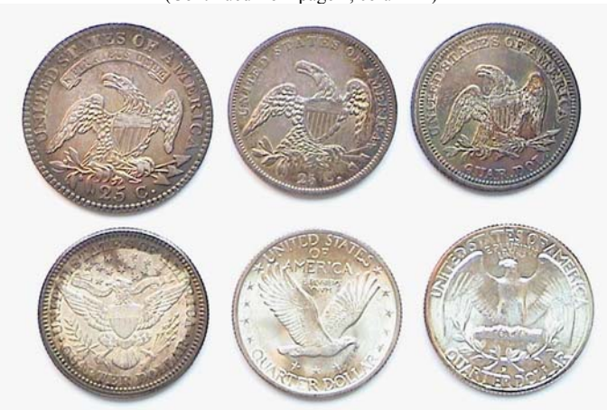
The reverses of the composite 25¢ type Set featuring both the large & small Bust Quarter (The coins are actual size)

Three of the reverses depict the Spread eagle; (top row above). This became one of our longest running reverse design types as it lasted some 85 years (thru 1891). It was designed by John Reich in 1807 for the new lettered edge Capped Bust half dollar and placed on the quarter in 1815. Unlike the half dollar-then our largest circulating silver coin--which was struck every vear except 1816, quarter production, was spotty until the reduced size Capped Bust quarter was reworked by William Kneass for 1831. Kneass removed the motto E PLURIBUS UNUM while refining the eagle and lettering. In 1835 Christian Gobrecht replaced Kneass who had suffered a stroke. Gobrecht is best known for the 1836 Liberty Seated no stars, soaring eagle dollar which bears his name. This was followed in 1837 by the no stars obverse Liberty Seated dime and half dime. By 1838, it was the quarter's turn to receive a face lifting but Mint Director William Maskell Patterson for reasons unknown decided to retain Reich's Spread Eagle for the quarter, (on the third reverse top right shown above.) Gobrecht's most significant alterations were the changeover from 25c to QUAR DOL. The upper lettering appears larger while the Spread Eagle is smaller.