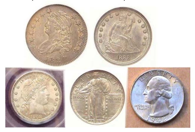
The obverses of a certified five piece 25¢ slabbed Short Set Top: I to r: 1920 large Bust quarter alongside 1988-S Liberty Seated Bottom: 1908 Barber, 1921 Standing Liberty and "raw" 1948-P Washington

Still, one has to move with the times and if these holders are becoming a thing of the past, one can display "slabbed coins" via the computer thanks to such software as "Picture It" and "Photo Shop" as well as for PowerPoint presentations.