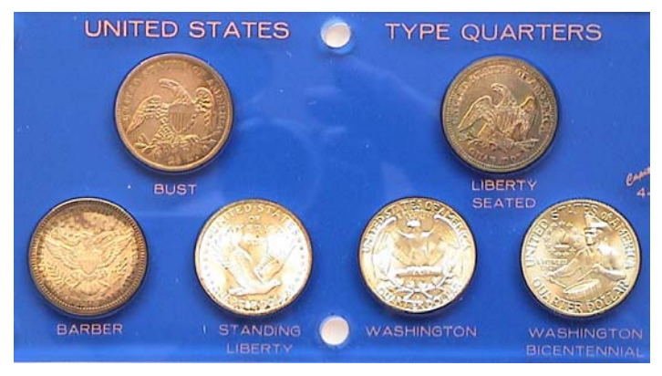
Capital's six coin US Type Quarters Short Set in Lucite Holder Shown at top are the reverses of the 1837 small Bust and 1859 Lib Std. Bottom: 1913 Barber, 1917 Type I Std. Lib., 1948-D and 1976 Washington's [Magnify to 200% to see details.]

As recently as 2002 there were still a number of early US type coins grading full Fine-15 through XF-45 that middle class collectors could afford, but with the tremendous increase of entrants attracted to the Hobby by the introduction of the Statehood quarter series in 1999, the supply has dropped while prices have soared for the small number that do surface. As a result, most serious collectors now opt to by only those coins that have been slabbed by the major certification companies. One of the by-products of third party certification has been the virtual elimination of quality "raw" coins from the market and regrettably, this has adversely affected the collector's options to display portions of one's collection in these attractive holders as shown at the bottom of column 1 and below.