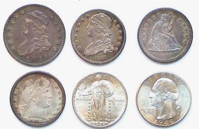
The obverses of a composite 25¢ type Set featuring both the large & small Bust Quarter (The coins are actual size) 1815 Lg. size Capped Bust, 1837 sm. size Capped Bust and 1859, Lib. Std. bottom: 1913 Barber, 1924 Standing Liberty & 1948-D Washington [Magnify page up to 200% to view details.]

Collecting Short Sets – Part Two - Quarter Dollar options By Arno Safran