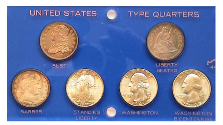
Capital's six coin US Type Quarters Short Set in Lucite Holder Shown at top are the obverses of the 1837 small Bust and 1859 Lib. Std. Bottom: 1913 Barber, 1917 Type I Std. Lib., 1948-D and 1976 Washington's

The following three design types in the bottom row reflect the changing artistic tastes of each period, each portraying different approaches by engravers Charles Barber, Hermon MacNeil and John Flanagan.