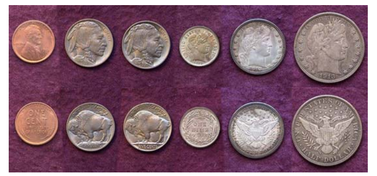
A 1913 Year set (excluding gold) showing both nickel types Reduced in size to fit on page [Use 3x glass or magnify page to 200% to view details.]

The 1913-P is easily the lest expensive in all grades. The one shown directly above was graded MS-63 Red by ICG.