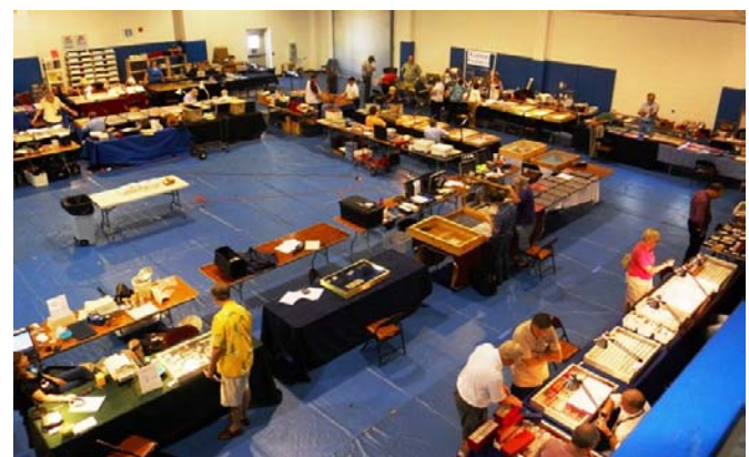
A section of a past Augusta Coin Club Show at Patriot's Park [Use 3x glass or magnify page to 200%]

The Augusta Coin Club will be holding their spring coin show on May 10 and May 11, a Friday & Saturday at Patriot's Park on Columbia Road in Columbia County, GA. The site is attended by thousands of area residents for the annual Fourth of July Fireworks festivities and despite concerns by some regarding its location, it is not unknown to the denizens of the CSRA. In fact, this section of Columbia County is the fastest growing area of the Augusta suburban population and has been so for more than four years. To get to Patriot's Park from Aiken or North Augusta, take I-20 west across the Savannah River into Georgia to Interchange 190. At the end of the exit ramp, turn right on to Lewiston Road. At the Columbia Road light, make a left. About a mile and a half, notice the Bartram Trail sub-division entrance on right and not far after that is Patriot's Park. [If you come to the William Few Parkway light, you have gone too far.] The hours for the show are 9:00 AM to 5:00 PM both days. Parking and admission are free. Fifty or more tables have been sold for past shows at this site which should provide ample opportunities for our club members to add to their collections.