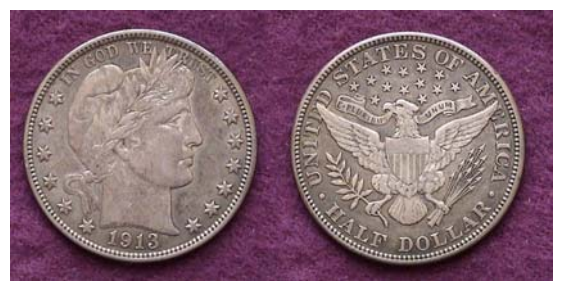
A 1913 Barber Liberty Head half-dollar grading XF-40 [Use 3x glass or magnify page to 200%]

Collecting the US Coins of 1913: 100 Years Ago By Arno Safran