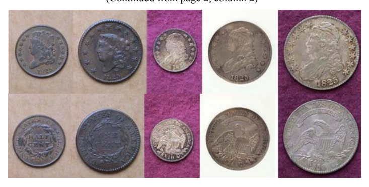
The Coins of 1825 (excluding gold) reduced in size [Magnify to 200%to see set more clearly.]

It is no mere coincidence that the five coins chosen to illustrate moderately priced higher end circulated coins with eye appeal all have the sane date; 1825. From 1808 through 1824 the Mint struck only a small number of the authorized ten denominations each year; never more than four (excluding gold). The resumption of the half cent n 1825 is significant in US coinage history as five denominations under the value of the dollar were struck for the first time since 1807 in a single year. All of these pieces produced 185 years ago have turned out to be fairly good investments even though none are rare or could be considered the key dates of their respective series. Shown in a row, the coins make up a nicely balanced set.