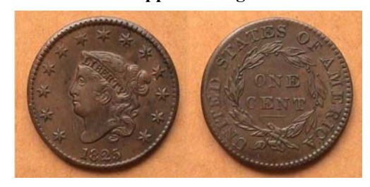
An 1825 Coronet Large Cent, N-6 R3 The coin was sold "raw" as an XF-45 The reported mintage for this date was 1,461,100 [Actual size when printed; Magnify to 200% to view details]

There is a large collector base for early American copper coins which collect mostly the half cents and large cents that were coined from 1793 to 1857. Many are seasoned collectors who prefer "raw" coins over "slabbed" for one very simple reason: In their view, the so-called professional graders overgrade copper coins almost to a fault. The sharpness grade of a copper coin is not as important as its overall condition or net grade. The net grade takes into consideration not just the amount of wear a coin has but the condition of its surfaces and rims, its color and its strike. To the copper coin collector it is better to own a lower grade VG-10 large cent with natural chocolate color, smooth surfaces free of rim dings or corrosion than one graded VF-20 appearing charcoal toned with lots of contact marks that is porous or corroded.