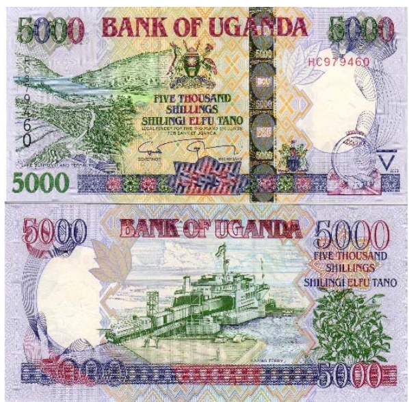
A 5,000 Shilling Banknote of Uganda [Magnify to 200% to see details.]

There were soldiers from Rwanda, Kenya, Tanzania and Burundi participating in the mission with us, so I was also able to obtain 500 and 1,000 franc notes and a 20 franc coin from Rwanda, a 1,000 shilling note from Tanzania and a 20 shillings coin from Kenya.