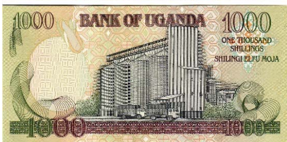
The face (top) and back (lower) of the 1,000 Shilling note of Uganda [Magnify to 200% to see details.]

The two highest denomination notes also have a design below the watermark on the front and the back of the note that appears to be random designs, but when held up to the light both designs merge to become a single object. This feature requires that the printing line up exactly on both sides, making it harder to counterfeit. The serial number is printed in black ink vertically on the left of the face and the numbers increase in size as they descend. It is repeated in red ink horizontally on the right of the face, with all the numbers being the same size. The notes also increase in size as the denomination increases.