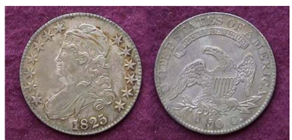
An 1825 Lettered edge Bust half dollar O-106 R4 The coin was sold "raw" as an AU-55 The reported mintage for this date was 2,943,166 [Actual size when printed: Magnify to 200% to view details]

The coin pictured above was acquired in 1999 for $425. Despite a reported mintage of only 168,000, the 1825 Bust quarter is not considered rare as a date. Upon closer magnification, the certified XF-40 specimen shown is accurately graded and "original" for a coin of 185 years and is attractive to the eye. Today it would for retail for $1,400.