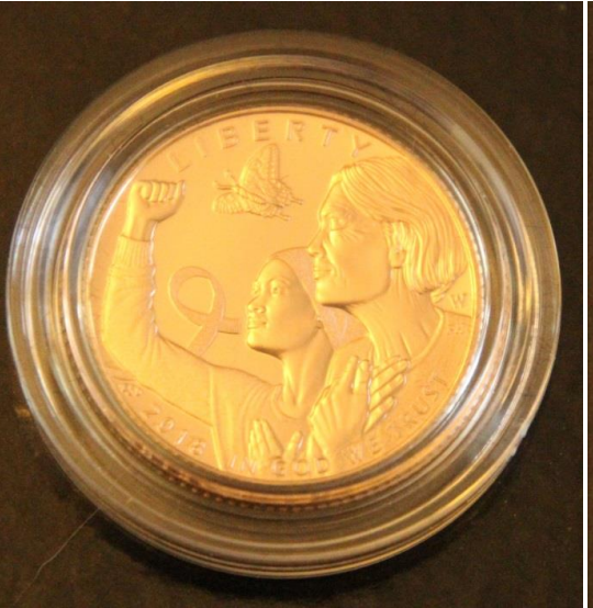
Obverse of 2018 Breast Cancer Awareness $5 Proof presented by Kuhl