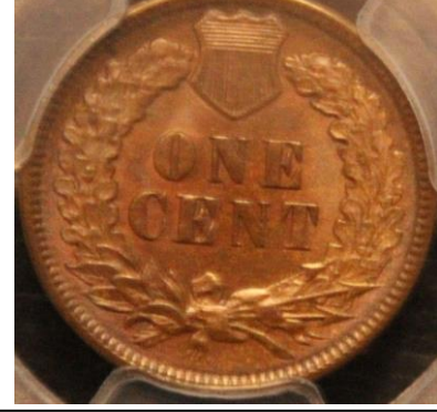
Safran's 1894 PCGS MS65BN Indian Cent