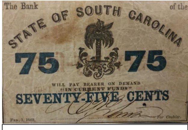
A 75 Cents 1863 South Carolina Fractional note shown by Garry Naples