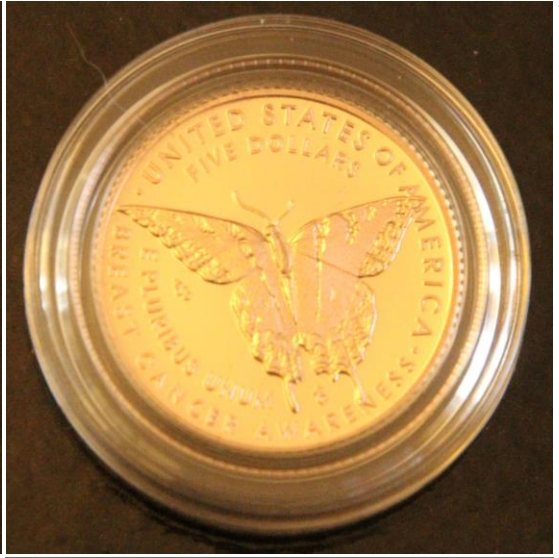
Reverse of 2018 Breast Cancer Awareness $5 Proof presented by Kuhl