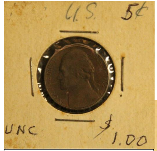
Obverse of Howard Hillman's "Ugliest Nickel" - just as it came from the mint