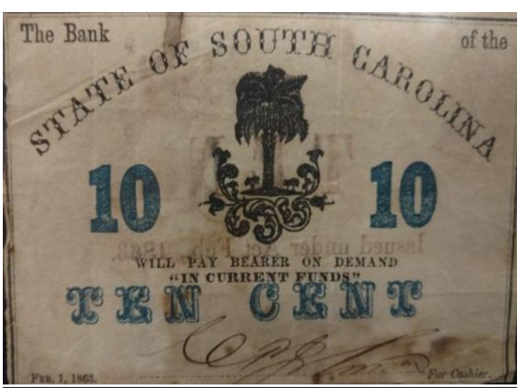
Close-up of Garry Naples' 10 cent SC note from 1863